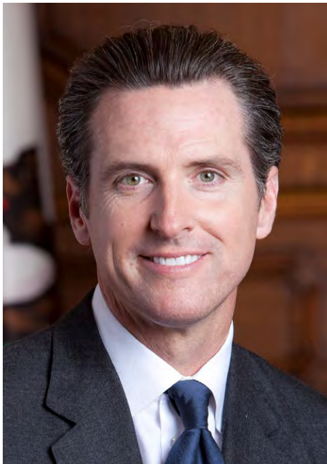
Gov. Gavin Newsom California